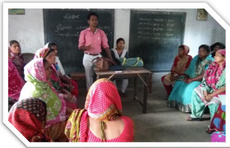
Councillor of Ward 29 sharing with community women benefits of SHG and motivating them to form group

Besides different meetings and trainings regular visits to banks and community meetings are held as an integral part of the mission activity.