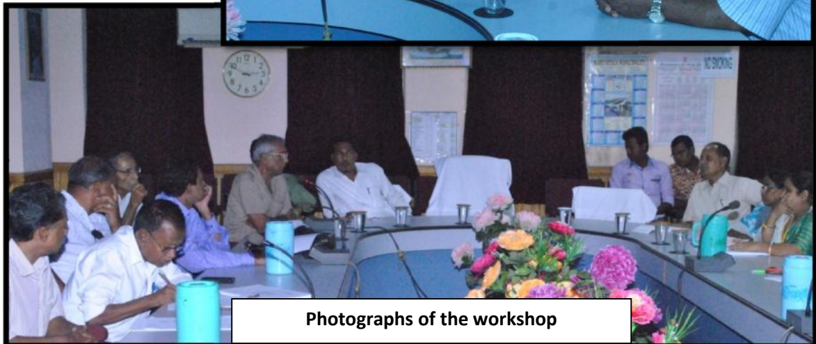
Photographs of the workshop