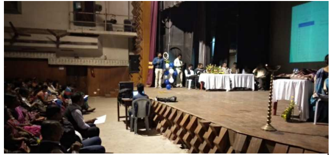
Presentation of the APP is ongoing in launching ceremony

Green City Mission is being implemented by Maheshtala Municipality to meet the growing challenge of rapid urbanization. State Government wants to build environment friendly, sustainable, livable, energy positive, IT friendly and safe city through the mission besides emphasising on building eco friendly and sustainable city.