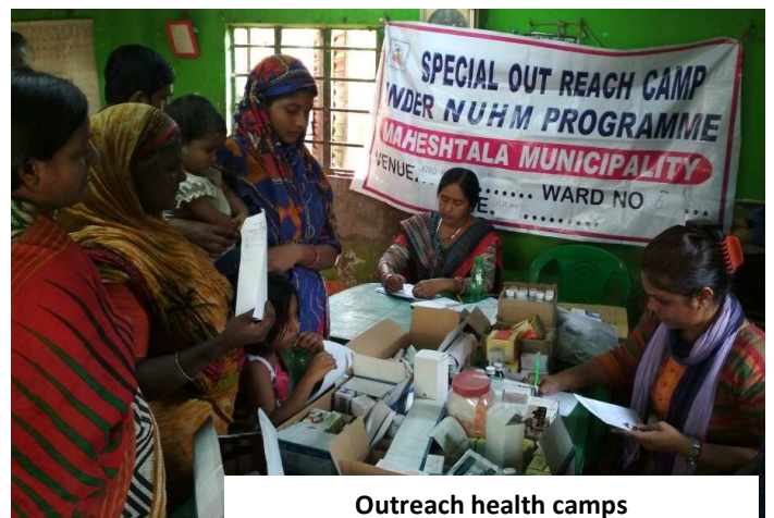
Outreach health camps

Like any other month 8 outreach health camps were organized in this month in eight different wards. Service and medicines were provided to 382 citizens of marginalized community through qualified doctors and nurses. With support of NUHM, it is earnest effort of the ULB to provide proper curative and preventive care to the people who are in need. Details about the camps are given below.