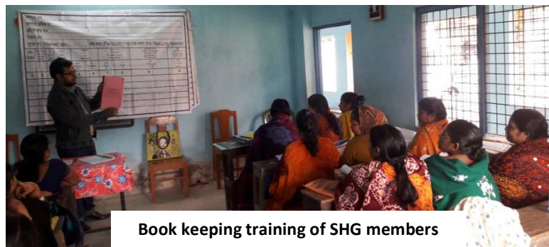
Book keeping training of SHG members

✓ 107 members from 11 SHG participated in two days Capacity Building Training in this month. Those groups belong to Ward no 14 and 35. Through the training members are being trained on book