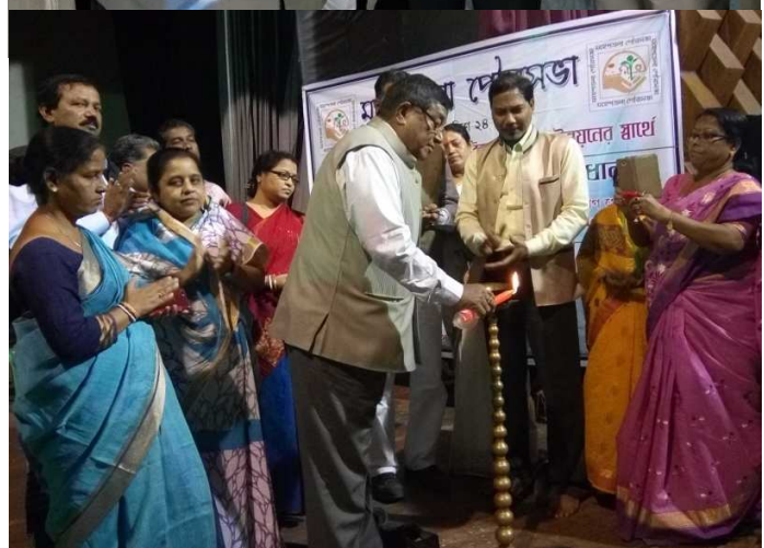
Inauguration of CLC

These following services will be provided through City Livelihood Centre (CLC):