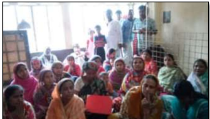
Meeting at Ward 12 for formation of SHG

As a part of NULM (National Urban Livelihood Mission) following activities took place in the month of March, 2016–